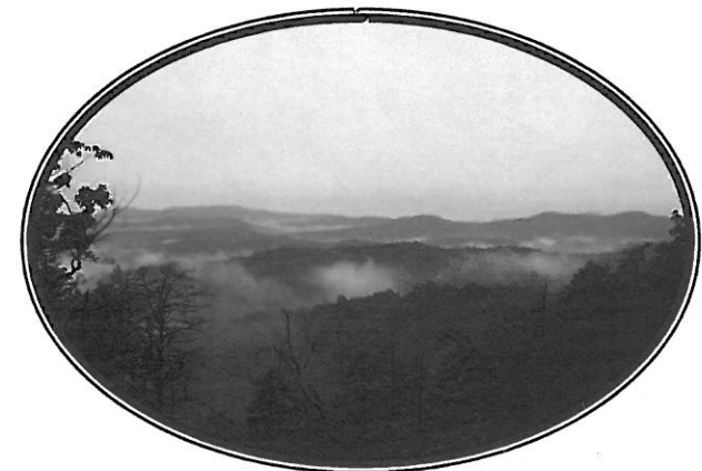
View from Sawtooth Trail Looking South.

Welcome to South Mountains State Park, a nature preserve of over 19,000 acres. The park has 33 miles of equestrian trails to ride and enjoy. High Shoals Falls and Chestnut Knob Overlook are a short walk from the trail. Hitching rails are provided to tie horses. Most of the trails are roads that have been graveled in some sections. The trails are moderate to difficult and they connect in loops that vary in length. Riders will be more comfortable on conditioned horses that can traverse ridgeline trails that climb and descend mountainous terrain. All of these loops start in the Equestrian day parking lot.